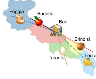
Fig. 2. Map of supply chain nodes in our case study.